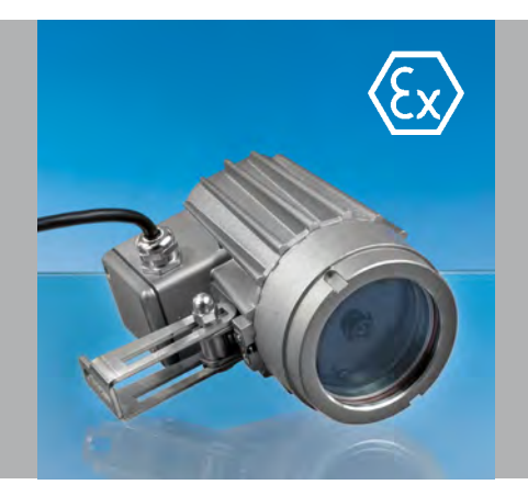
VISULEX Ex-Camera K06-Ex aluminium, with fixed lens II 2G Ex de IIC T6 Gb II 2G Ex the IIIC T80°C Db The lens of this camera is set during installation to focus on the property or object to be monitored. This can be an outdoor area, outdoor facility or part of a technical process. Maximum transmission